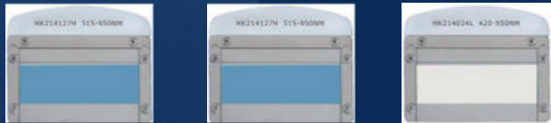
Wavelength: 515-950nm Wavelength: 550-650nm Wavelength: 420-950nm