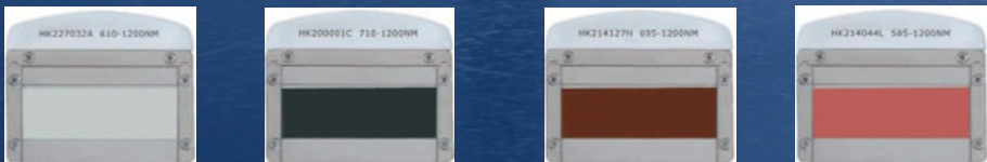
Wavelength: 610-1200nm Wavelength: 710-1200nm Wavelength: 695-1200nm Wavelength: 585-1200nm