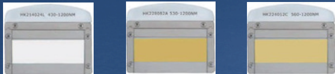
Wavelength: 430-1200nm Wavelength: 530-1200nm Wavelength: 560-950nm