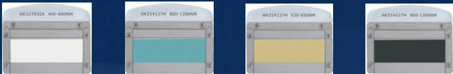
Wavelength: 400-600nm Wavelength: 800-1200nm Wavelength: 530-650nm Wavelength: 530-650nm