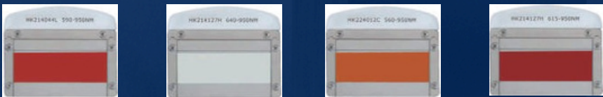
Wavelength: 590-950nm Wavelength: 640-950nm Wavelength: 560-950nm Wavelength: 615-950nm