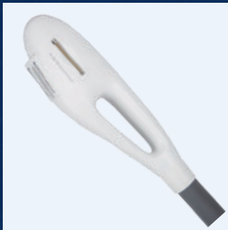
F+EH handle (optional)